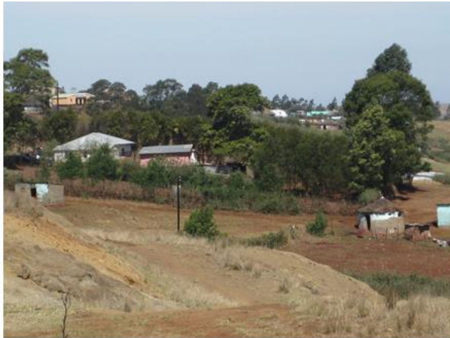
Black wattle around Transkeian homestead

African smallholders on communal lands planted black wattle around their homesteads as a quick-growing source of timber, fuel and shade in higher rainfall districts east of the Drakensberg. It was resistant to fire, could be pollarded, and also spread itself, diminishing the need for systematic planting. Black wattle was at one time ubiquitous as a household agroforestry crop in parts of the Eastern Cape, KwaZulu-Natal and Mpumalanga. No calculation has been made of the scale of smallholder tree stocks but by the end of the twentieth century plantations covered about 130,000 ha. and an estimated 2.5 million ha had been partially invaded (de Wit et al, 2001). Black wattle is interesting for the same reasons as prickly pear – it creates havoc around our categories and is, in the words of scientists, a ‘conflict of interest’ species. It has attracted academic analysis in South Africa and is one of the few species for which a systematic cost benefit analysis has been attempted.