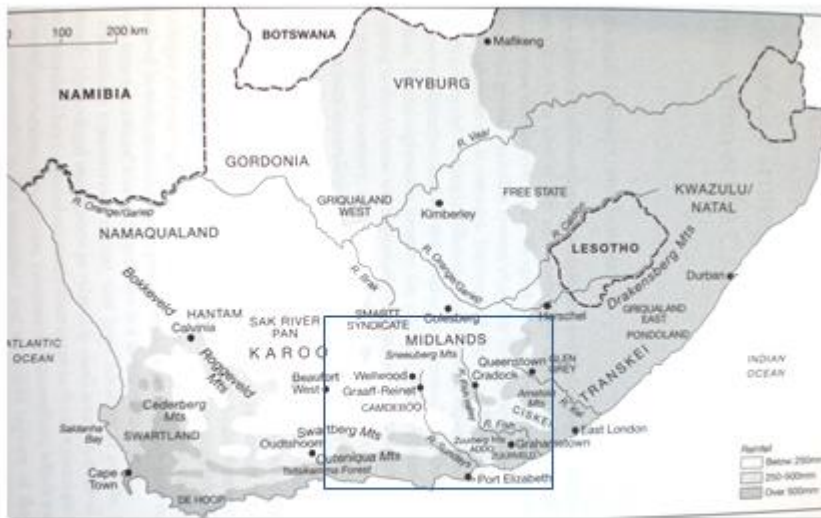
Main area of prickly pear invasion in the Cape

cloning from cladodes. If reproduced from seed, most spineless plants reverted to thorny varieties. This was the general pattern as prickly pear became invasive in the second half of the nineteenth century. By the later decades of the nineteenth century, sweet, wild fruits – abundant in many central and eastern Cape districts - were collected free and widely eaten by people, both black and white. Some were sold to the towns. Prickly pear fruit beer became a favoured beverage for poor black people in districts where the plants thrived. The plant was also used for yeast, syrup and soap. Local knowledge and culture was expanded around an exotic.