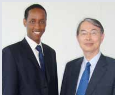
Hashi Mohammed with ICC Judge Sang-Hyun Song

Many months had elapsed since completing the job application. Waiting in yet another reception area with other anxious candidates, it struck me how privileged I was to have made it this far. With 500 applications on average accepted to each set of Chambers, only two are selected. As if these seemingly insurmountable statistics were not enough, rejections are dispatched during – not after – the