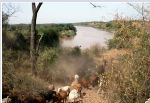
Cattle returning from drinking at the Omo in the dry season

As its name implies, it was hoped that the project would be relevant to conservation policy and help to resolve conflicts between conservationists and local people (two national parks were set up in the area in the 1960s and 1970s). As it got under way, however, it became clear that both conservationists and local people would soon be faced with the most devastating human-induced environmental change in the history of the Lower Omo. This would result from the construction of a hydro-electric dam in the middle Omo Valley, which is due to start operating in 2013. Known as Gibe III, the dam will eliminate the annual flood, upon which all the residents of the Omo flood plain depend, and make possible the development of large-scale commercial irrigation schemes. These schemes are now being implemented, without the collaboration, consent or even prior knowledge of local people. If evidence from elsewhere is anything to go by, this is likely to have devastating human and environmental consequences. We are therefore lobbying the Ethiopian government and the international donor community (Ethiopia currently receives more UK development aid than any other country) in the hope that urgent steps will be taken to avert what looks like an otherwise inevitable tragedy. For background information go to www.mursi.org/news-items/huge-irrigation-scheme-planned-for-the-lower-omo-valley