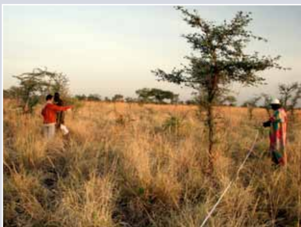
Vegetation survey of 50 x 50m plots to investigate bush encroachment patterns

Ethiopia’s Lower Omo Valley is best known as one of the most important sites in the world for the study of human evolution. The earliest known fossils of our anatomical ancestor, Homo sapiens , were found here in 1968, making this the oldest landscape in the world known to have been inhabited by modern humans. And yet our knowledge of its recent history remains remarkably superficial. The aim of this three-year project (2007–2010), funded by the Arts and Humanities Research Council (AHRC) under its Landscape and Environment Programme, was to investigate human–environmental interaction in the Lower Omo Valley, using historical, anthropological and palaeoecological methods. The project team consisted of one historian (Professor David Anderson, Principal Investigator), one palaeoecologist (Dr Graciela Gil-Romera) and two anthropologists (Dr Marco Bassi and Dr David Turton).