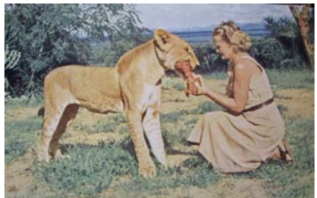
Joy Adamson and Elsa, 1958