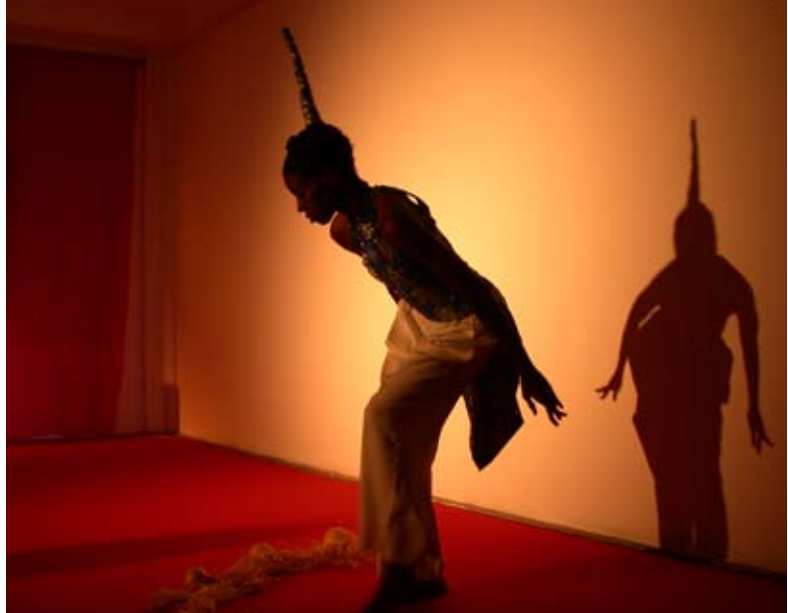
The performing scene I am now writing about has been shaped by this history. But it has also been deeply affected by the structural adjustment era of the 1980s. Major funding for music, dance and theatre now comes from Europe and the US. Nevertheless, the hundreds of urban dance troupes spread all over Senegal make up a thriving youth scene. Talent is often revealed during neighbourhood events and family ceremonies, where young people experiment with the latest dance crazes from “mbalax” videos, Senegal’s dominant popular music style.

In the 1960s, one-third of the state budget was devoted to the Ministry of Culture, and in the next two decades Senegal went from one extravaganza to the next, from the 1966 World Festival of Negro Arts to the Mudra Afrique contemporary dance school, a National Ballet that toured the world and a National Theatre troupe that was performing “Africanised” versions of Molière and Shakespeare plays in Paris.