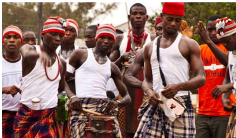
Agba masquerade, Ikot Akpa Nkuk, 2008