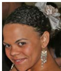
Marbre Stahly-Butts (US)

The politics of FGC in Somaliland: grassroots activism, government reluctance and international interference