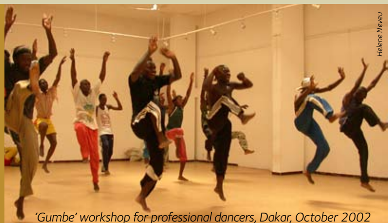
'Gumbe' workshop for professional dancers, Dakar, October 2002

The MSc programme in African Studies welcomed its fourth cohort in October 2008. The 30 students were spread between nine colleges across the university, and participated energetically in the many activities organized throughout the year.