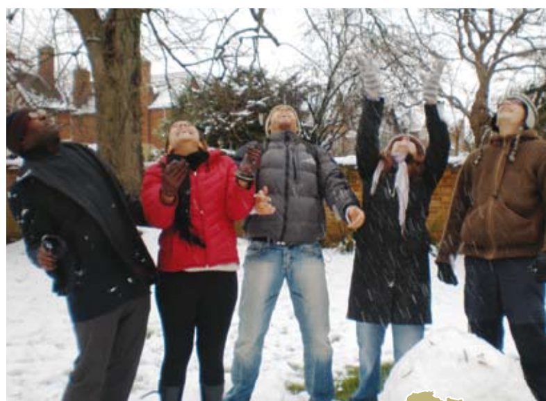
But it's not all hard work...