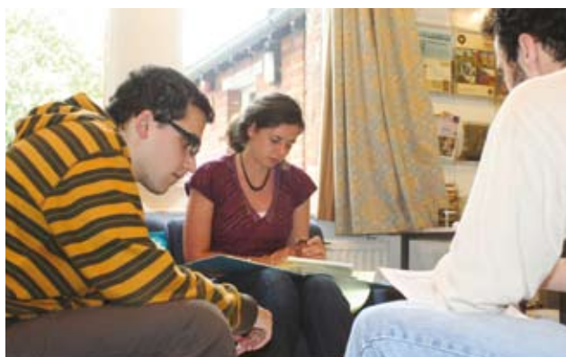
African Studies MSc students revising