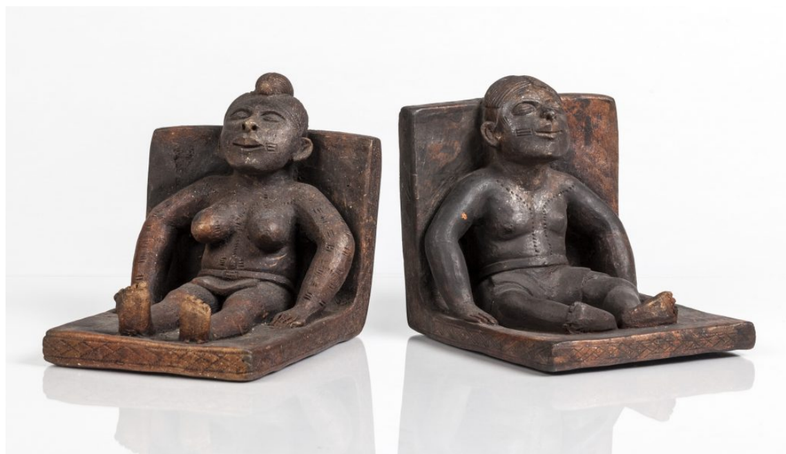
Pottery bookends attributed to Mbitim in the Powell-Cotton Museum.

Once inside the Powell-Cotton museum, the objects were recorded in the catalogue as Mbitim’s. But the museum has probably over-emphasised his individual role. The next steps of the research are to look for other objects attributed to Mbitim and see what connections can be established. There are many questions still to answer. But this one pottery workshop at Li Rangu is a really interesting study as a ‘contact zone’ between Europeans and local artists, through which influences may have spread in multiple directions.