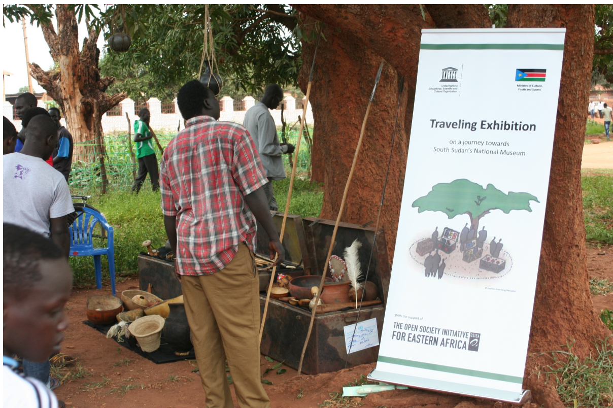
The 'Travelling Exhibition' in Wau, 2014.